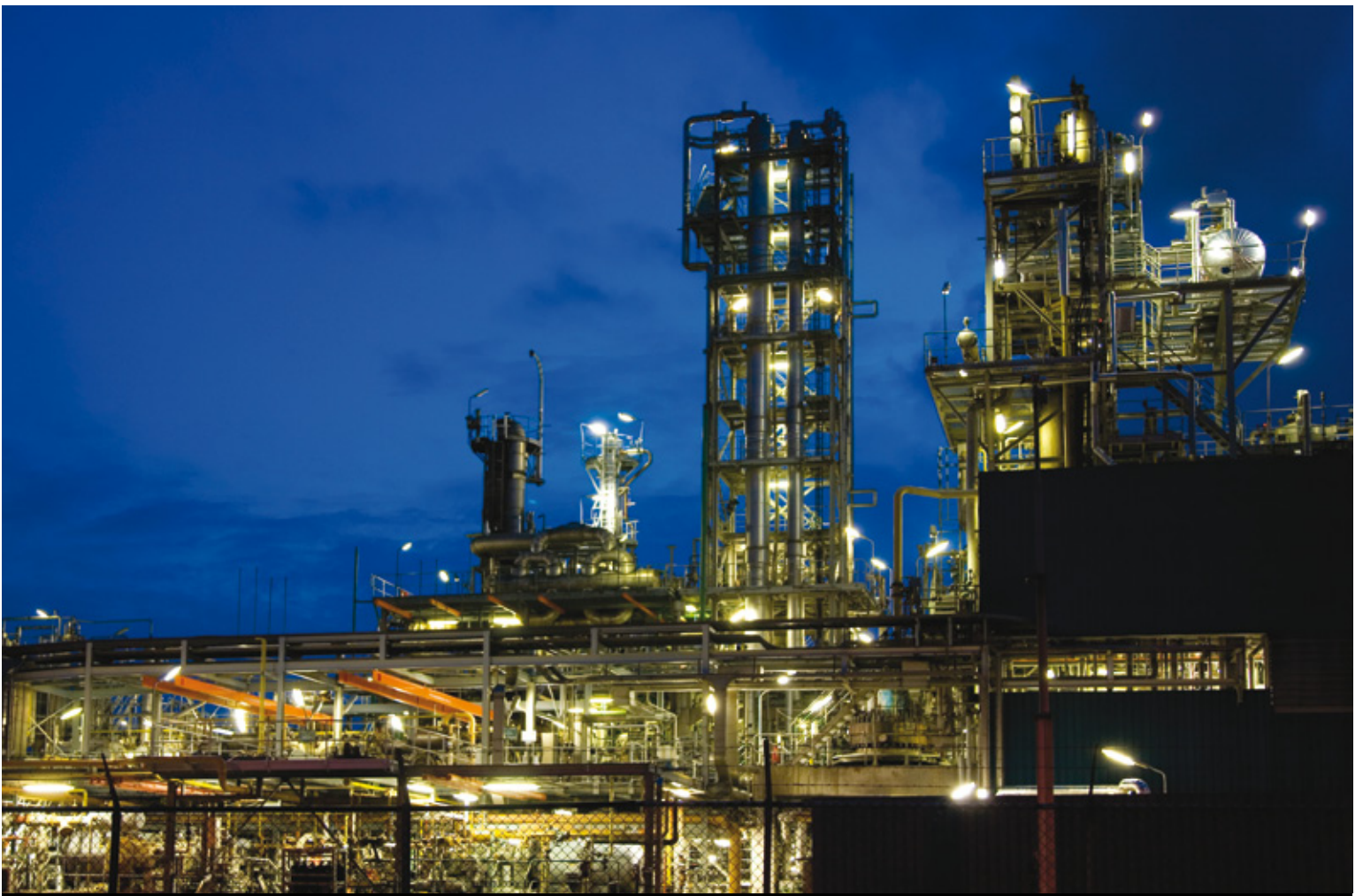
ABB in the Chemical and Petrochemical Industries